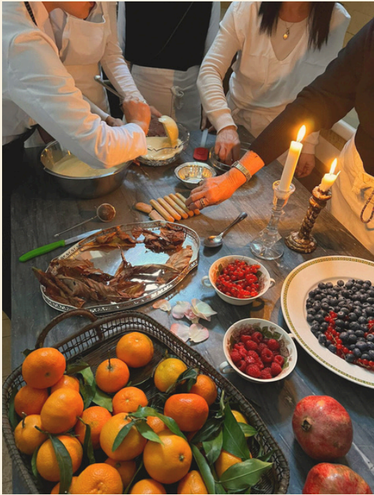
TABLE SETTING AND DECOR, COOKING CLASS & LUNCH- DINNER